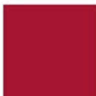
Red 3117 similar to RAL 3013