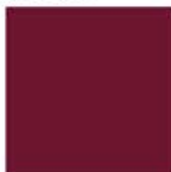
Dark red 3603 similar to NCS S 5040-R