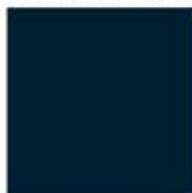
Dark blue 5603 similar to RAL 5008